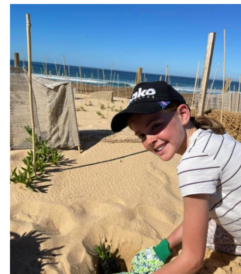
National Tree Day 2023

Just before National Tree Day, the Mayor planted the first of 1000 trees. The site is still being closely monitored, as a spring flush of weeds is expected. However, Council aims to plant 100 advanced trees with CCLF and community in March 2024 – so stay tuned. Overall, over 3000 native plants (1000 being trees) will be planted by July 2025.