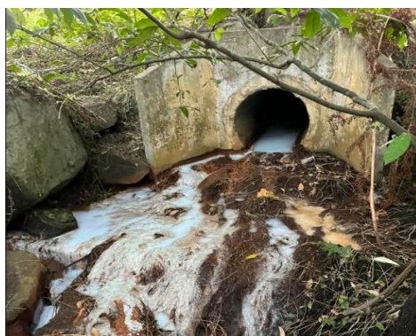
Paint discharging from a stormwater drain into Greendale Ck

Booms were immediately installed at a stormwater outlet and downstream at the concrete bridge.